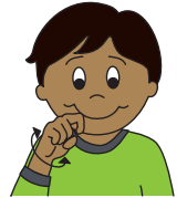
apple Close hand and place knuckle of index finger against cheek. Pivot hand back and forth.