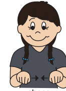
shoes Make both hands into fists; tap fists together.