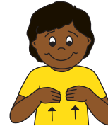
blanket Hold hands low, palms facing your body, and thumbs tucked. Pull hands to chest level as if pulling a blanket up over your body.