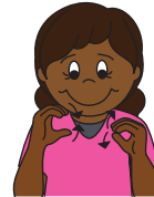
bubbles Make O sign with each hand. Alternating hands, move them up and down, opening and closing fingers like popping bubbles.